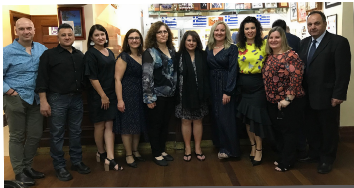
Greek Parents' Committee