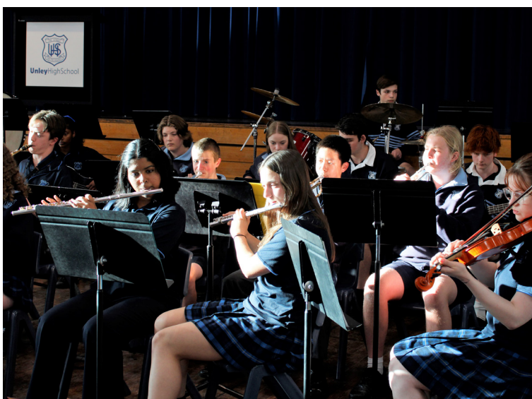
Year 9 Band