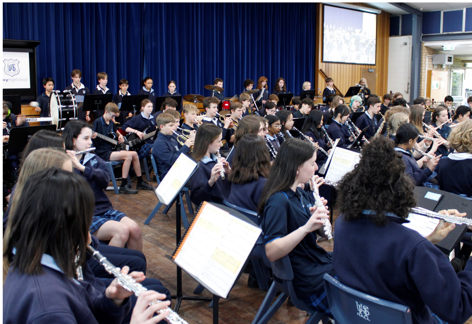
Year 7 & 8 Combined Band