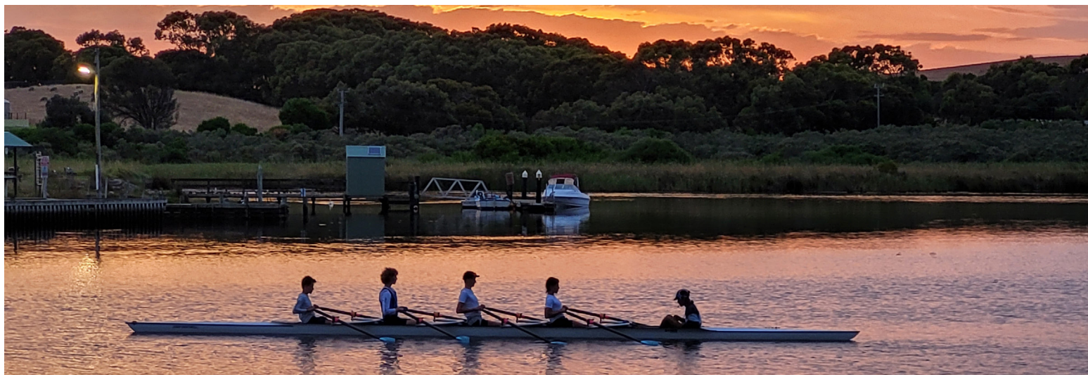
Summer Rowing Camp – Glenelg River