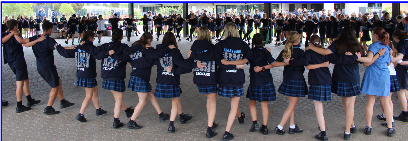
Greek Independence Day celebrations